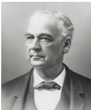
ATTORNEY AND FORMER JUSTICE SOLOMON HEYDENFELDT

if the rule were not a “preference favorable to one religious profession” but simply, as Justice Field asserted, “a mere civil rule of conduct,” it still violated the state Constitution. Article I, section 1, declared everyone “by nature free and independent,” and recognized Californians’ “inalienable rights,” including “acquiring, possessing, and protecting property, and pursuing and obtaining safety and happiness.” The majority, shaped by the Gold Rush zeitgeist , found the law failed as a secular, economic regulation because it restricted one’s right to work and acquire property.